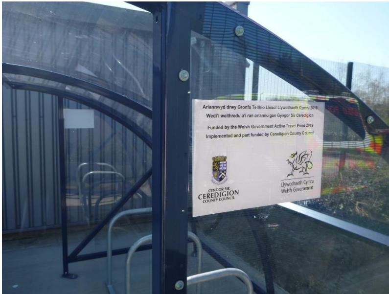
Left: A new cycle shelter was installed at Cardigan Police Station in Parc Teifi Business Park in conjunction with the shared use path scheme referenced above.