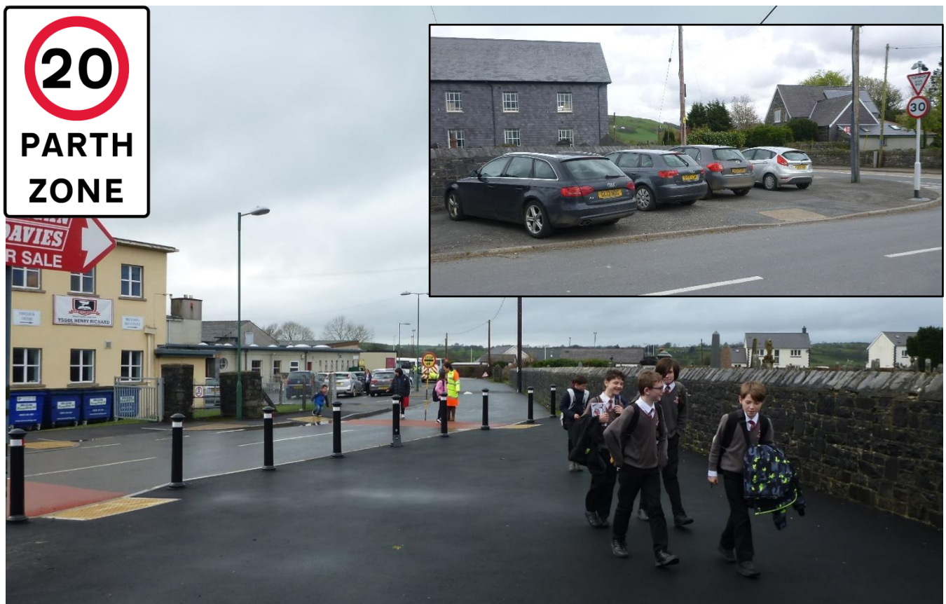
Below: Pre and post scheme photos showing road safety improvements at the school entrance.

In addition to the above snapshot of grant funded construction schemes, Ceredigion County Council has utilised the Integrated Network Map Route Development grant from Welsh Government during the 2018-19 financial year to progress proposals and scheme designs for some of the aspirational Active Travel improvements within Aberystwyth, Cardigan and Lampeter.