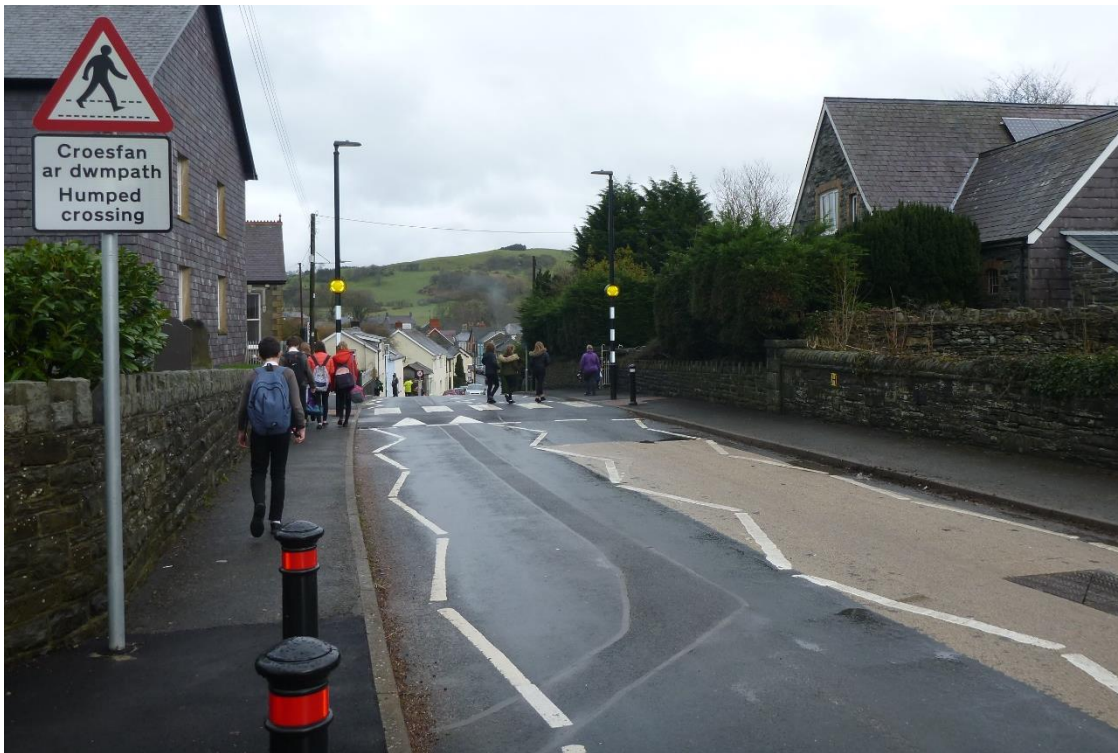
Left: New raised table zebra crossing installed between the Town Centre and the school.

New traffic calming measures were installed as part of the scheme which included a new raised table zebra crossing, alongside the introduction of new 20 mph zones and a part time 20 mph limit. Improvements at crossing points with dropped kerbs and tactile paving along with improved footways and new bollards help to provide safer routes to the school to encourage increased Active Travel journeys. The County Council re-deployed its School Crossing Patrol officer to the new school location to further ensure the safety of pedestrians accessing the school.