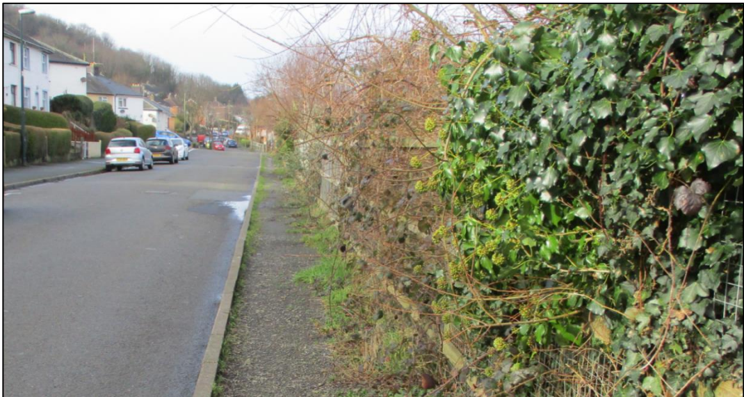
Left and below: before and after construction photos.

Responding to requests from local mobility users who could not use the narrow unbound path adjacent to the allotments on Fifth Avenue, the County Council funded a scheme to widen the path with provision of a smooth tarmac surface. This provided an improved link to access the nearby shared use path link into Aberystwyth Town Centre which had been improved in the previous financial year.