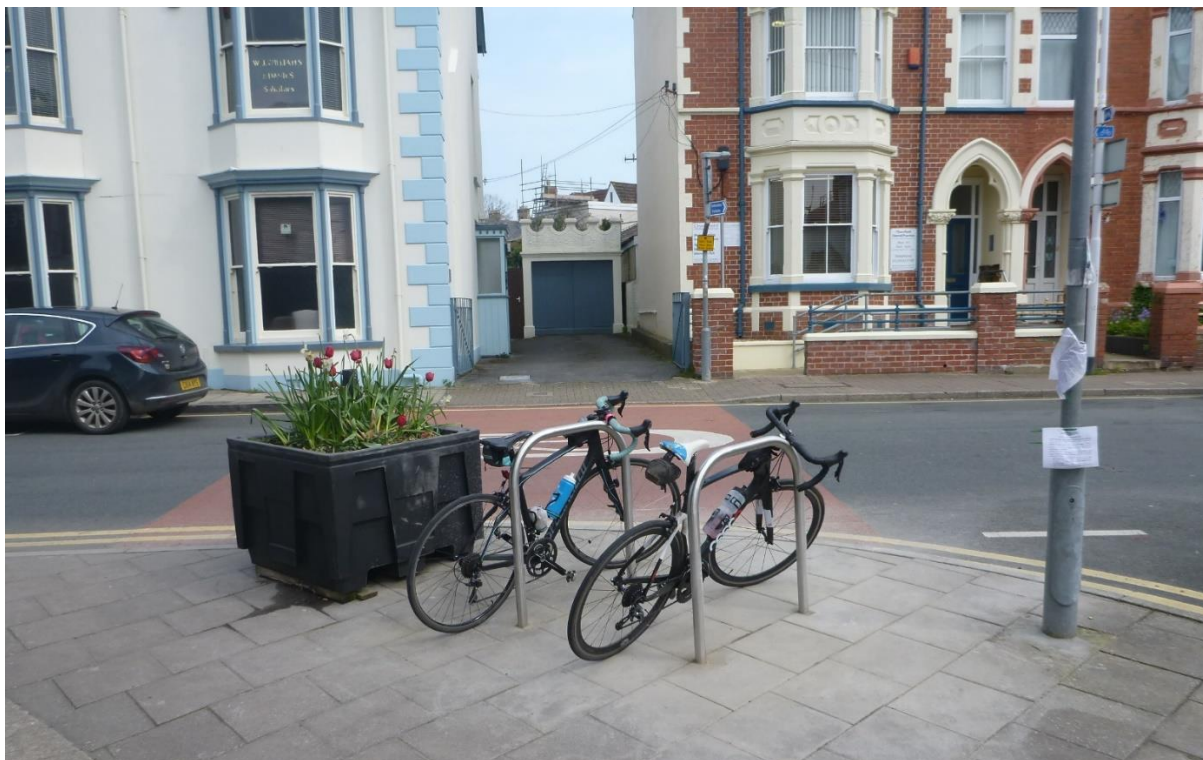
Below: 2 new cycle hoops to accommodate 4 cycles were installed on the corner of Morgan Street in Cardigan Town Centre.