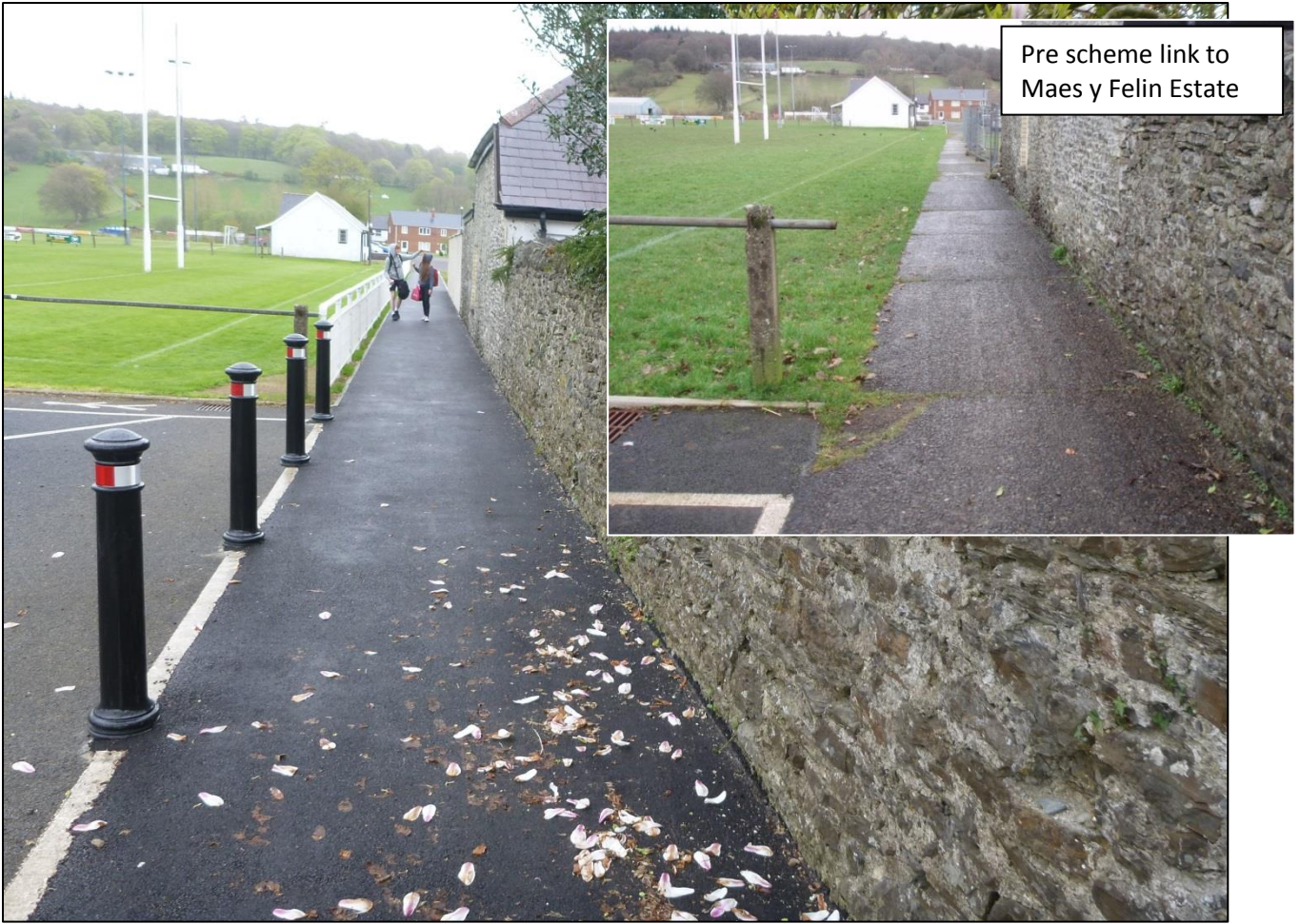
Pre scheme link to Maes y Felin Estate