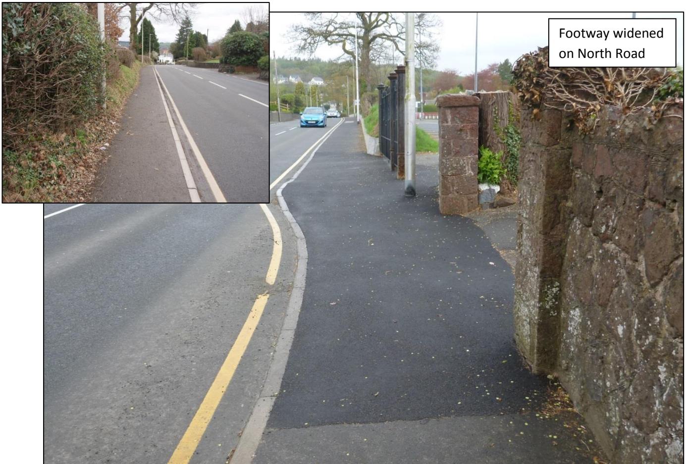
Footway widened on North Road