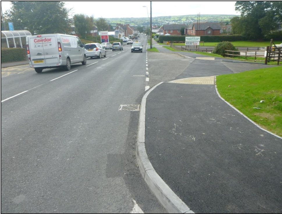
Left: New footway link installed.

The Cardigan package also included widening of the footway on Pont y Cleifion Road following an additional in-year grant award of £47,000 from the Welsh Government following early completion of the above work, thereby increasing the total package value for Cardigan to £162,000. This enabled dropped kerbs to be installed to provide an improved link for pushchair and mobility users on this route between the Town Centre and Parc Teifi Business Park.