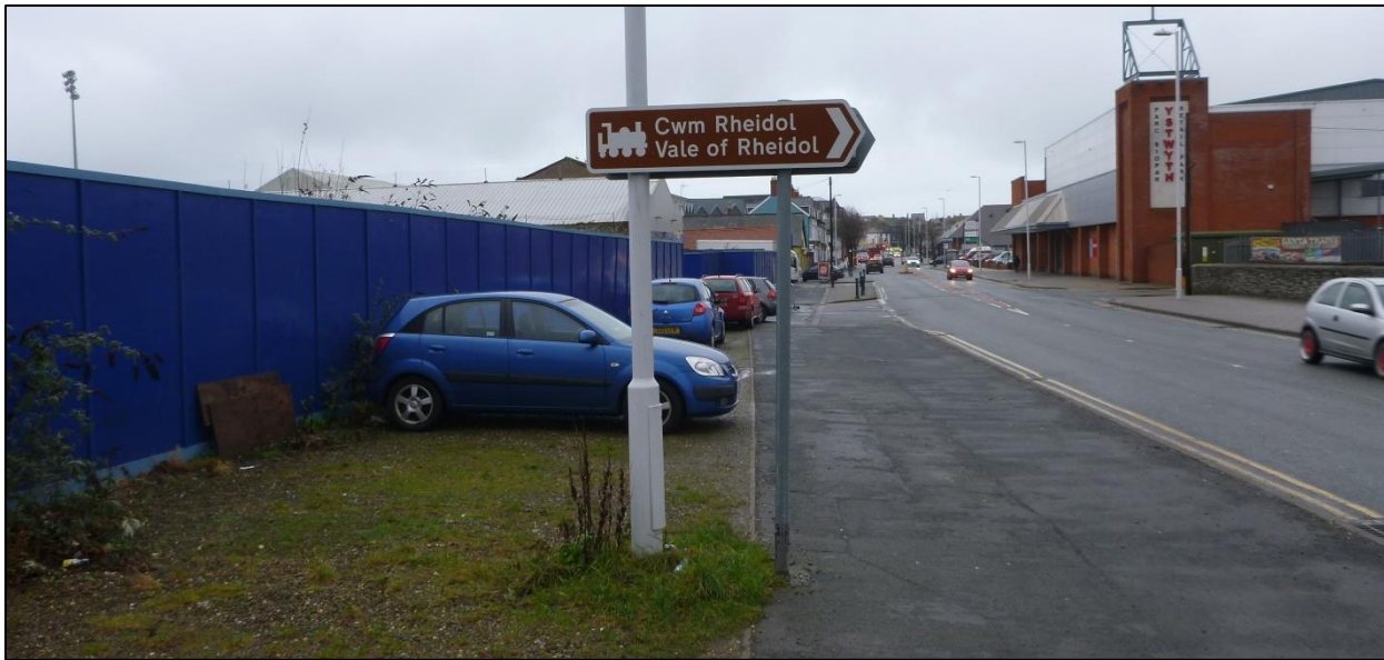
Pre scheme showing car parking issue on and behind footway on Park Avenue: