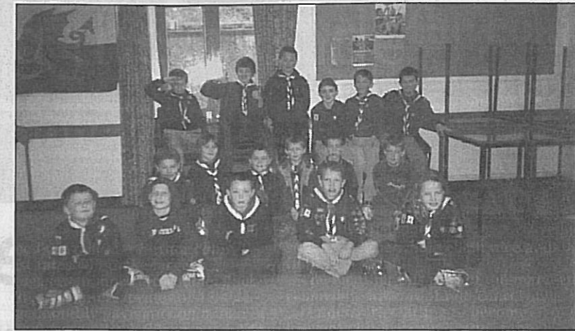
PRESENT: The Cub pack at Tresaith camp, March 2003.