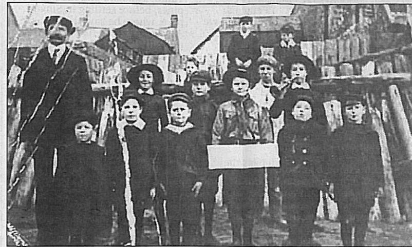
PAST: The 1st Borth Sea Scouts taken in 1910.